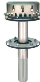
Fire protection drain Art.-Nr. 22521.070X