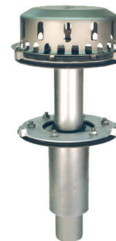
Fire protection drain Art.-No. 22522.070X