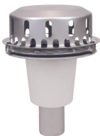
Drain Art.-No. 21512.070X

one-piece clamping flange for bituminous and plastic roofing sheets