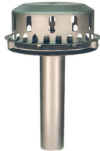
Fire protection drain Art.-No. 22501.070X