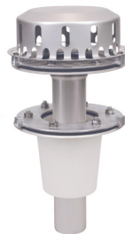
Drain Art.-No. 21522.070X

two-piece clamping flange for bituminous and plastic roofing sheets