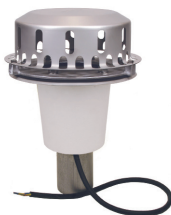
Drain Art.-No. 21513.070X

one-piece clamping flange for bituminous and plastic roofing sheets