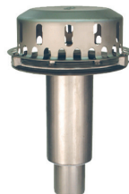
Fire protection drain Art.-No. 22502.070X