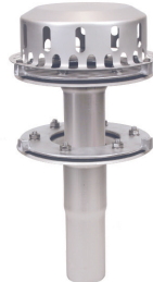
Drain Art.-No. 21521.070X

two-piece clamping flange for bituminous and plastic roofing sheets