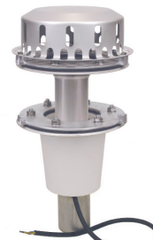
Drain Art.-No. 21523.070X

two-piece clamping flange for bituminous and plastic roofing sheets