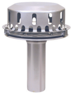
Drain Art.-No. 21511.070X

one-piece clamping flange for bituminous and plastic roofing sheets